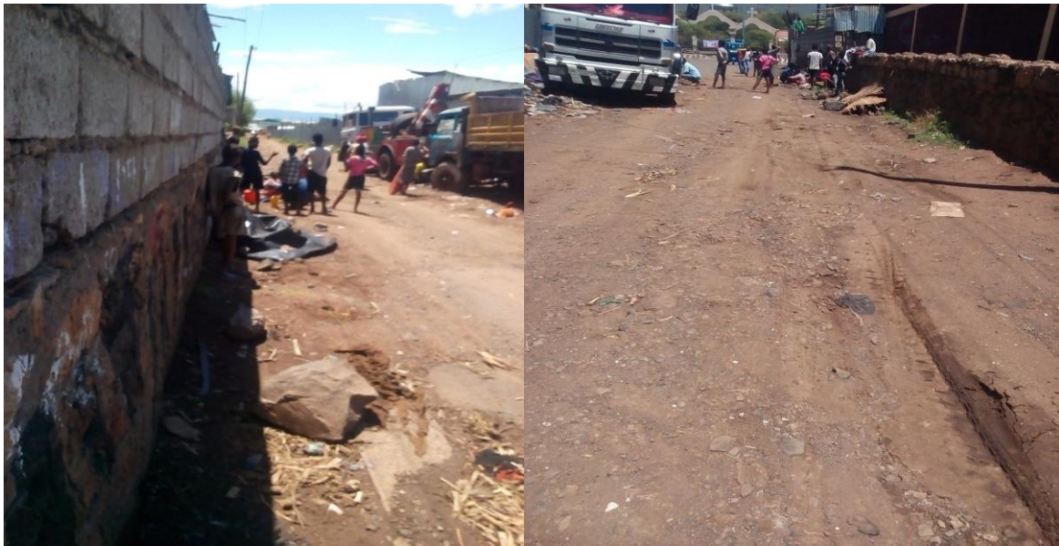
Figure 4.1: The livelihoods challenges of street children in Sikella sub-city, Arab Minch