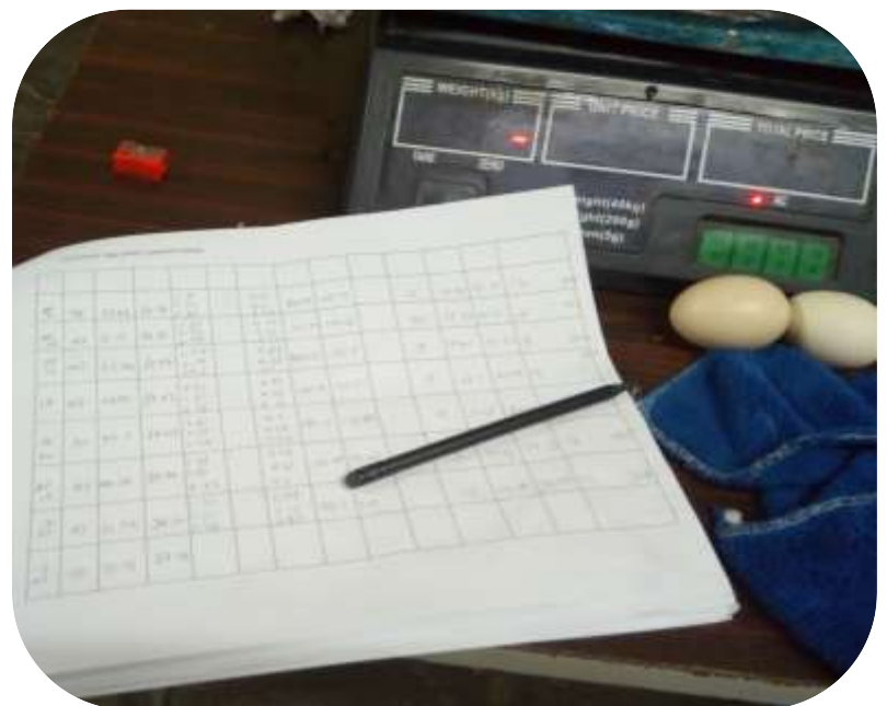
Figure in the appendices 3 Electronic balance to measure egg weight