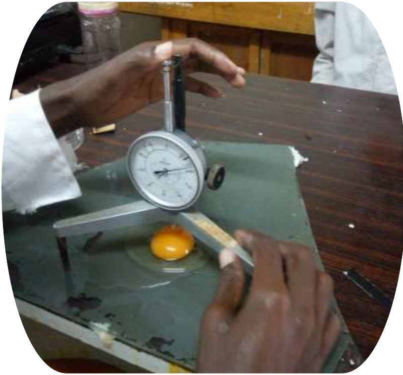
Figure in the appendices 4 Tripod micrometer to measure albumen height and yolk height