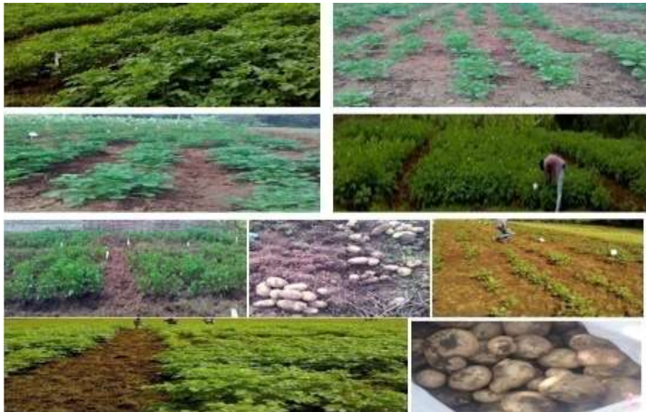
Appendix figure 1. Different pictures during research process, during the 2019 growing season Duna District

Where pH = Hydrogen power, OM% = Percent of organic matter, CEC = Cat-ion exchange capacity TN% = Percent of total nitrogen, Av.P.ppm = Available Phosphorus in parts per million